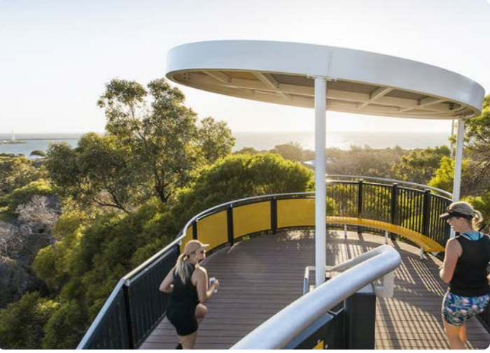
TIMBER VIEWDECK AT THE TOP OF THE RAMP