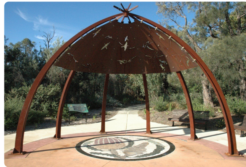
FEATURE SHELTER TO LARGE KNOWLEDGE EXCHANGE AREA

ELEVATED TIMBER DECK RAMP WITH BALUSTRADE FOR DISABILITY ACCESS. DEPTH OF FOOTING FOR RAMP WILL NOT INTERFERE WITH CONTAMINATION ZONE (1M DEEP). NO SHELTER ON THIS RAMP ACCESS.