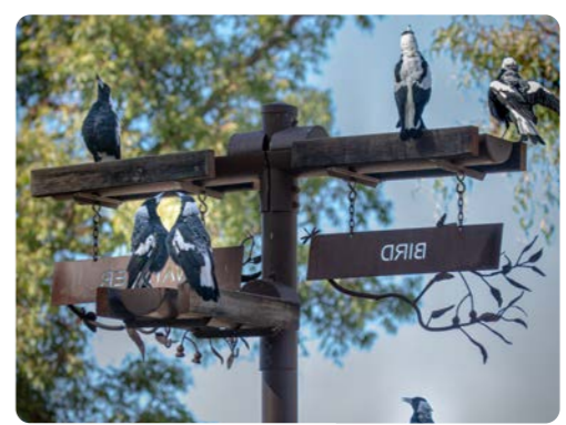
BIRD WATERING STATION