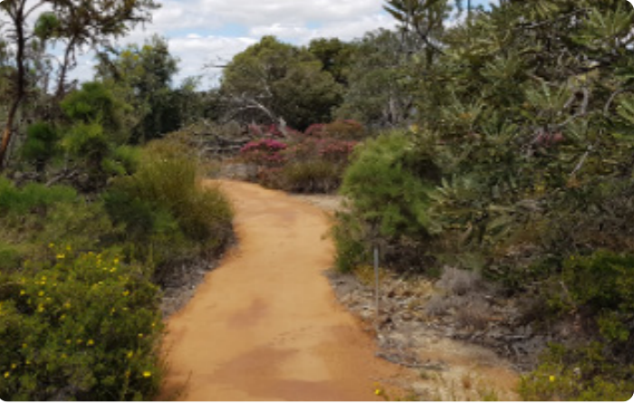
CLAY ROAD BASE OVERLAID WITH POLY SEALANT FOR ALL ABILITY ACCESS