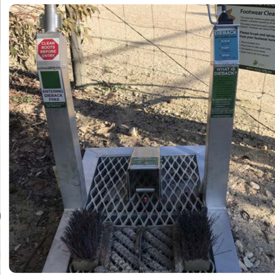
BOOT CLEANING STATION