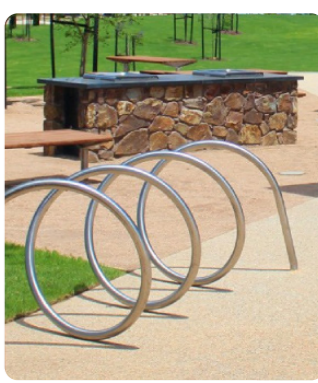
SPIRAL BIKE RACK