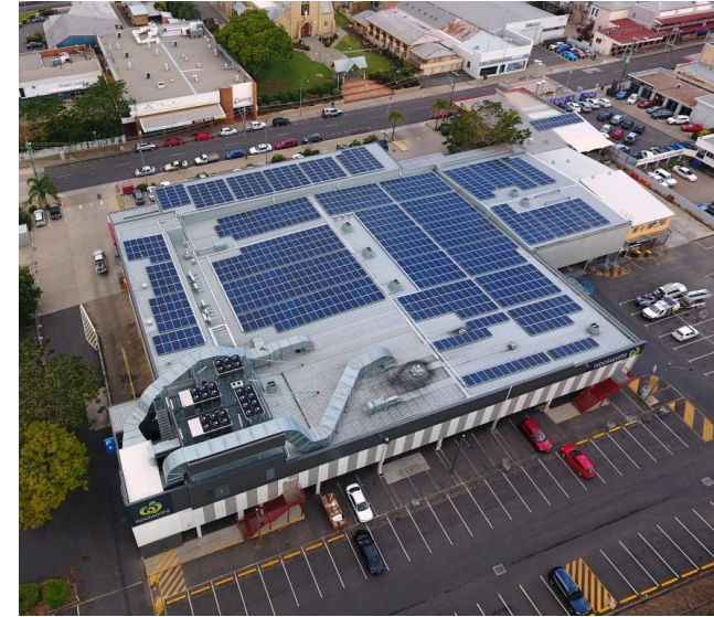
Aerial photograph of completed solar PV system