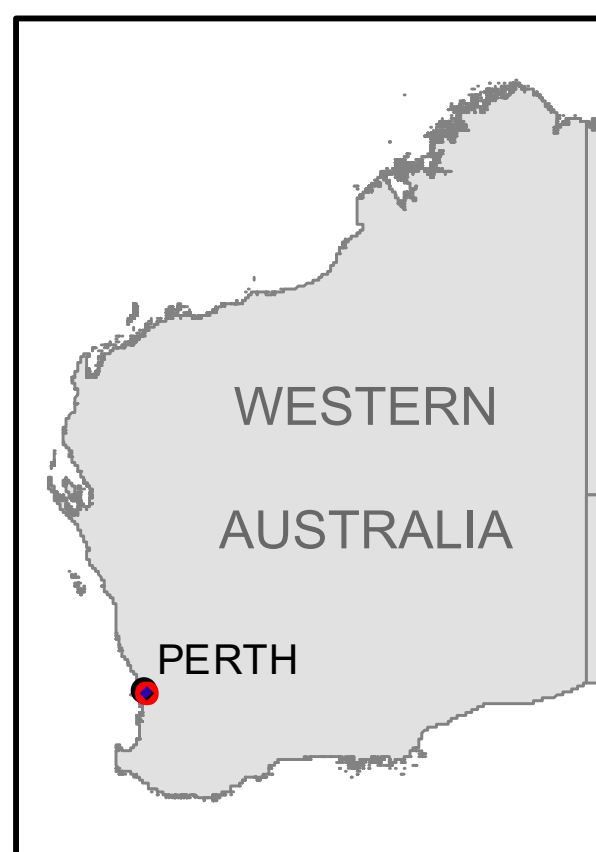
ToVP Figure 14-2 Aspirational Cycle Network for the ToVP