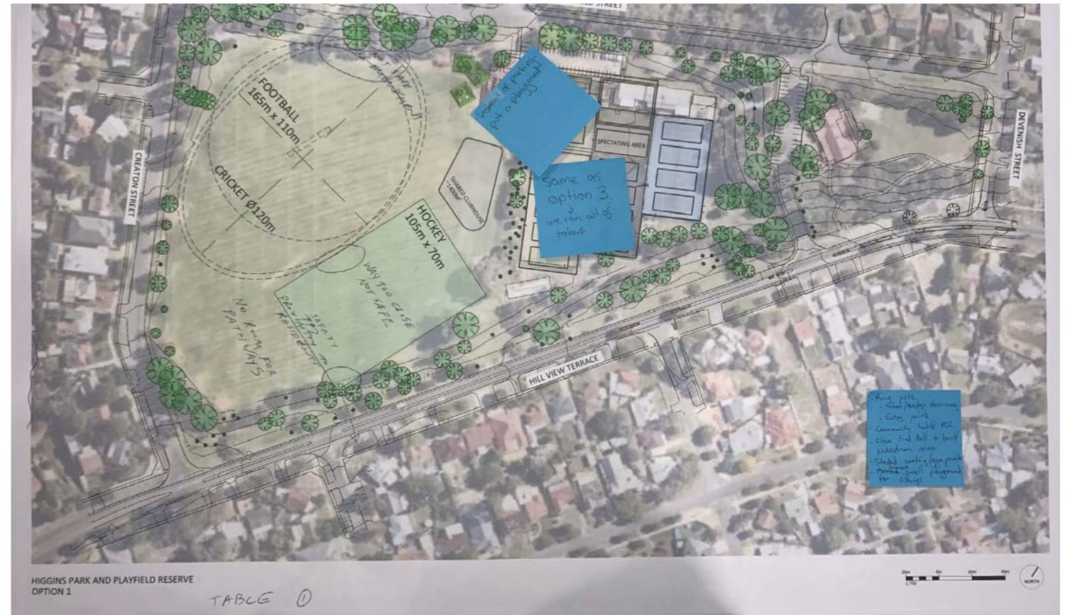
Table 1 - Option 1