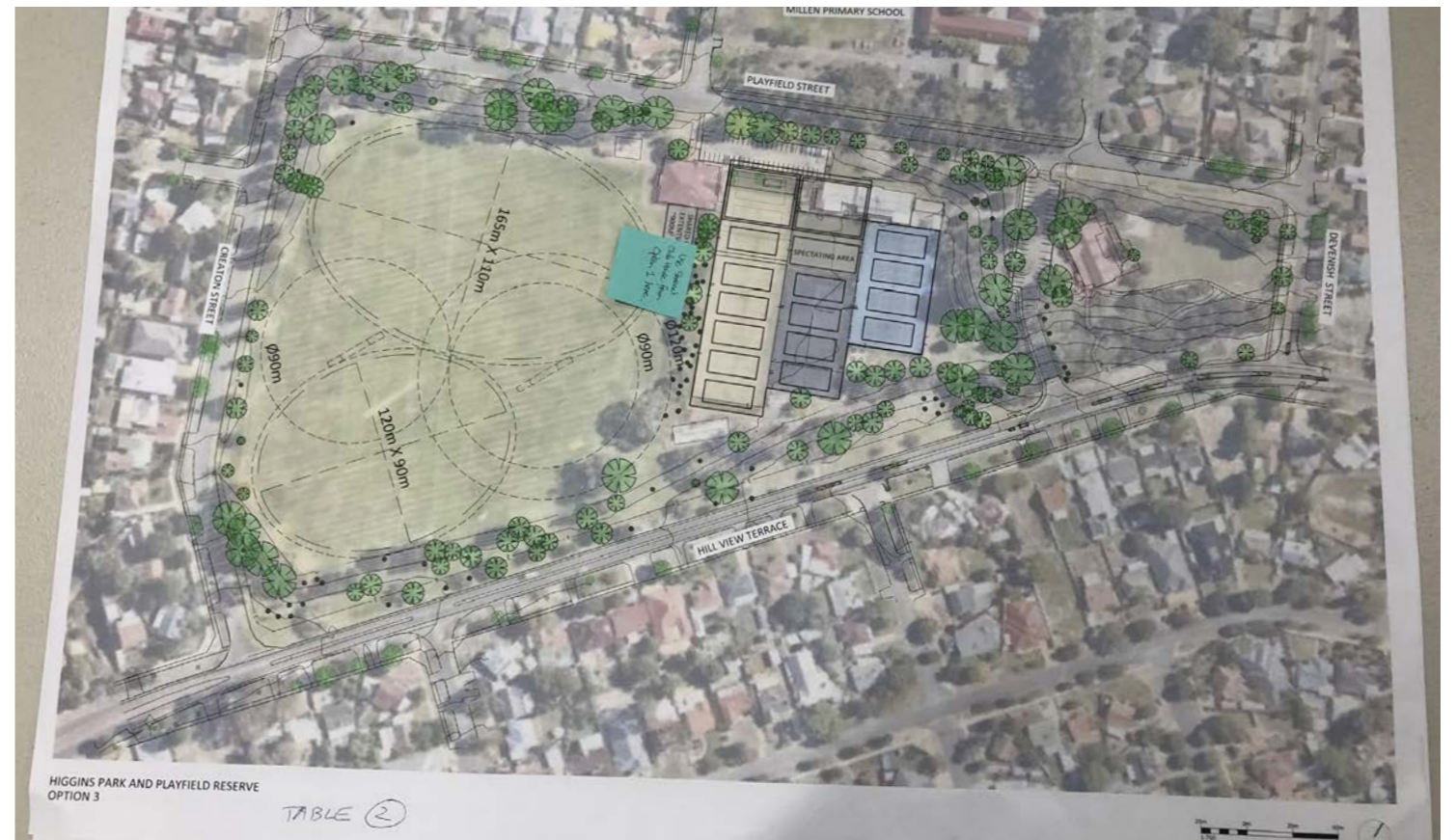
Table 2 - Option 3