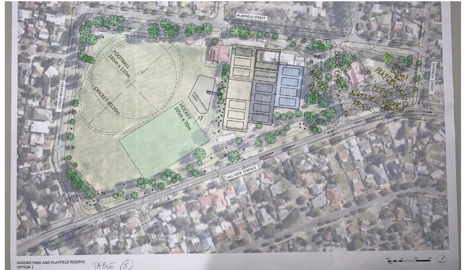
Table 5 -Option 1