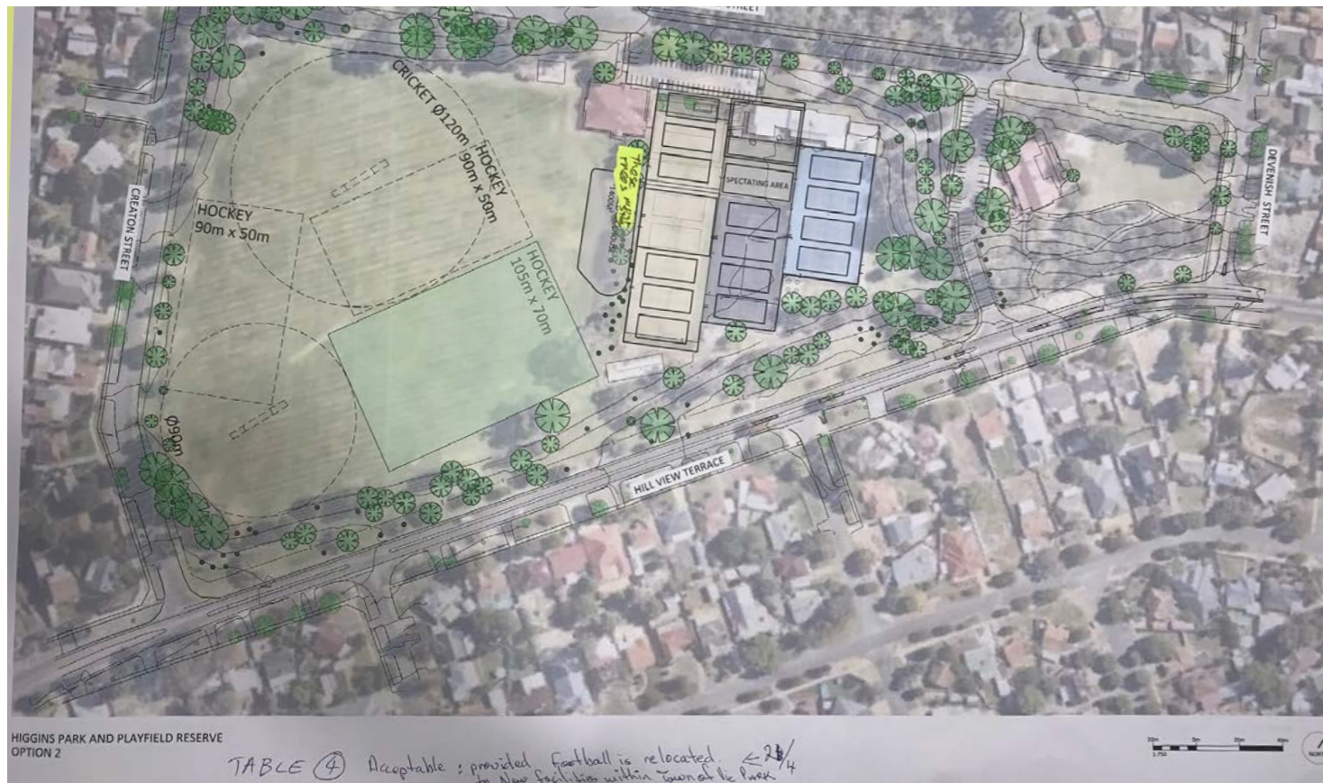
Table 4 - Option 2