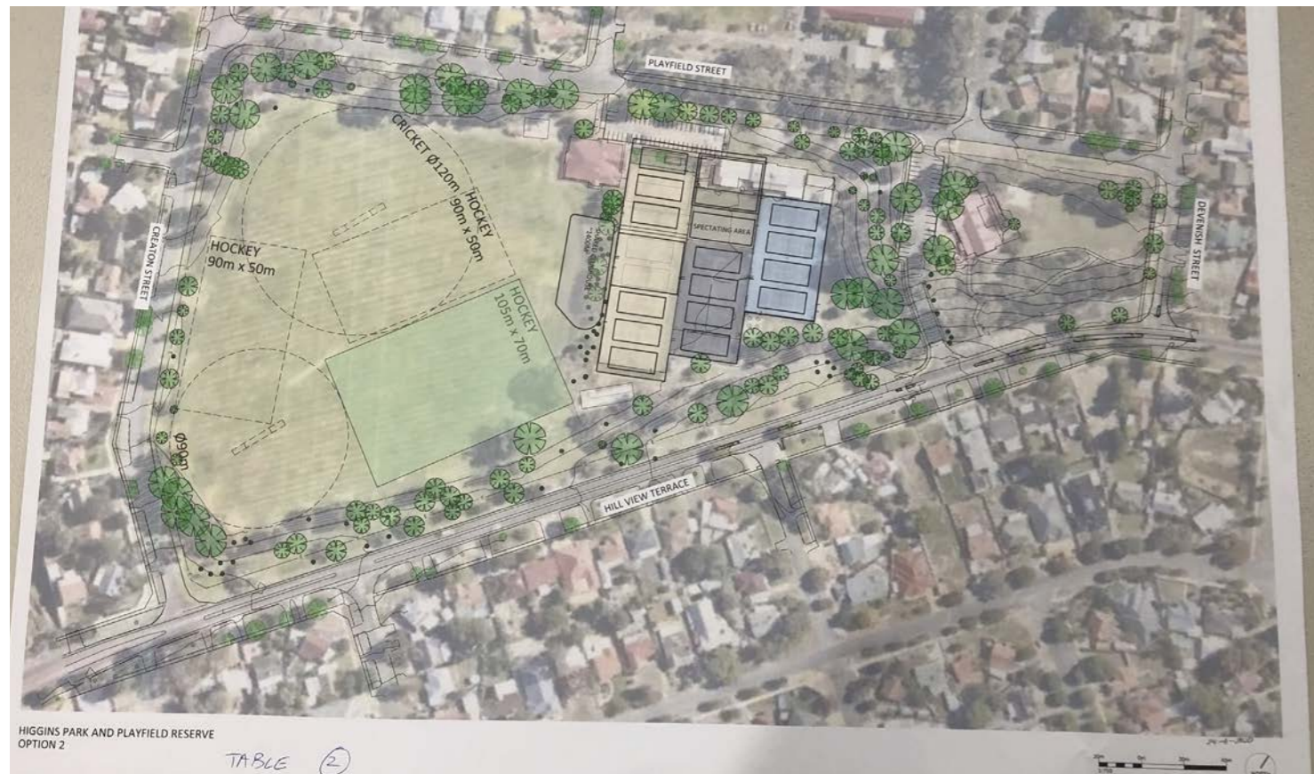
Table 2 - Option 2 *No response entered