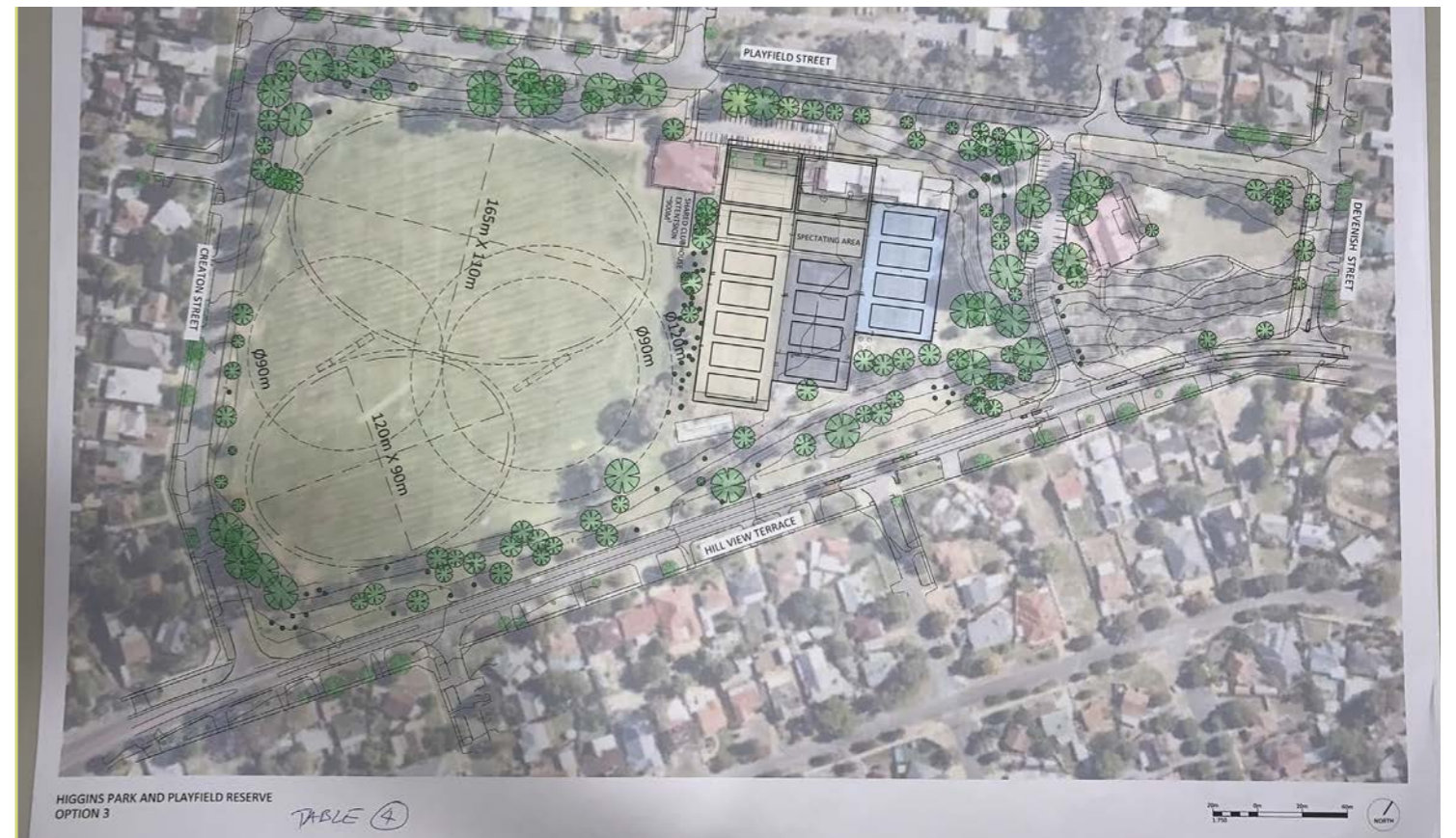
Table 4 - Option 3 * No response entered