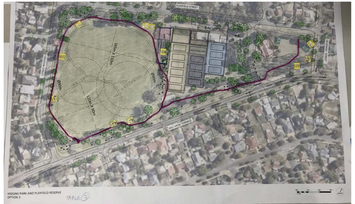
Table 3 - Option 3