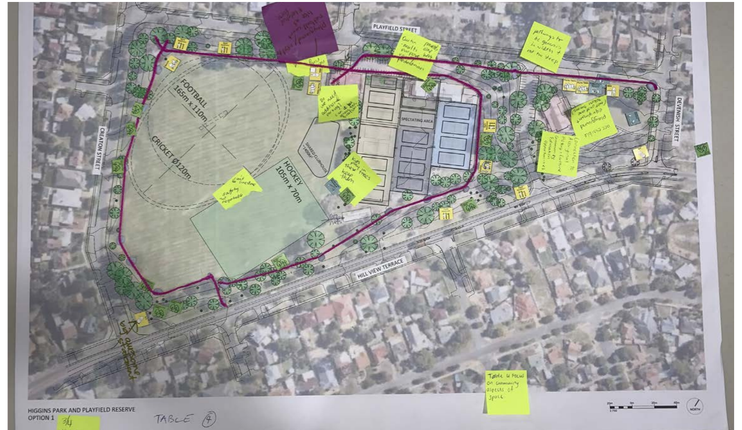
Table 4 - Option 1