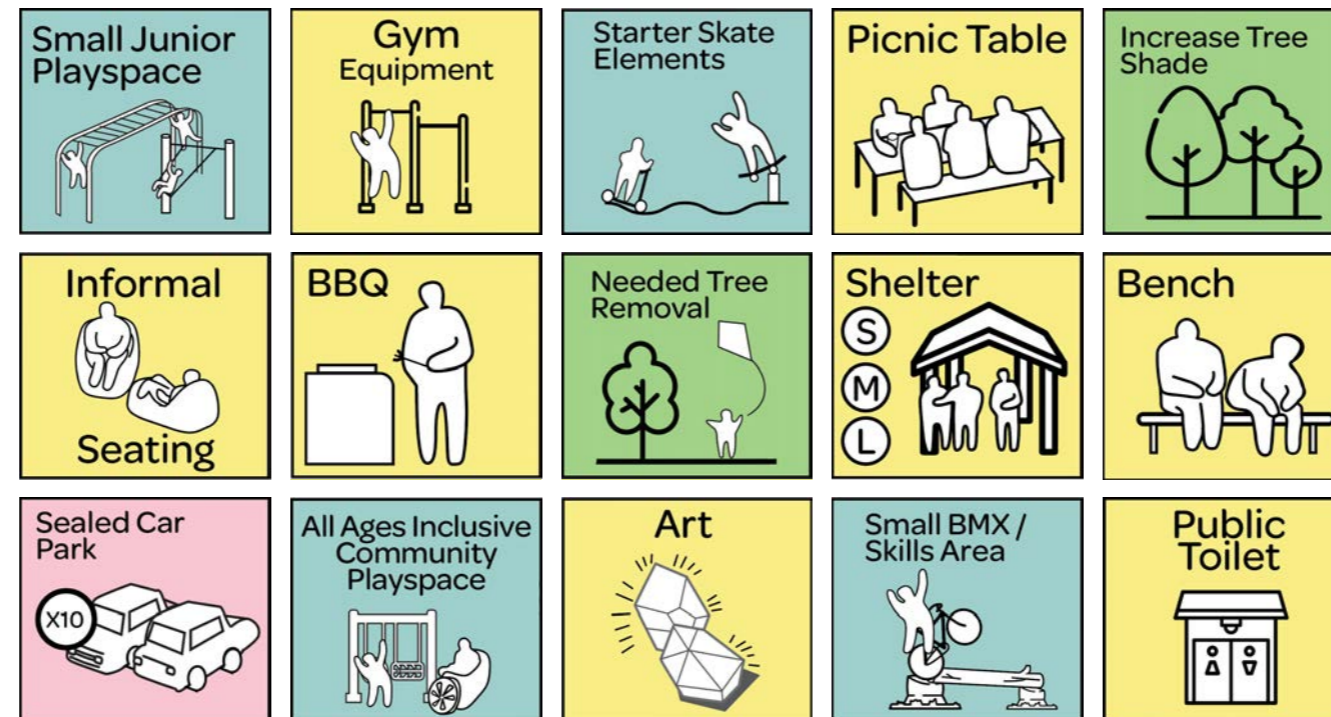
Above: Boardgame elements as part of Workshop 3.