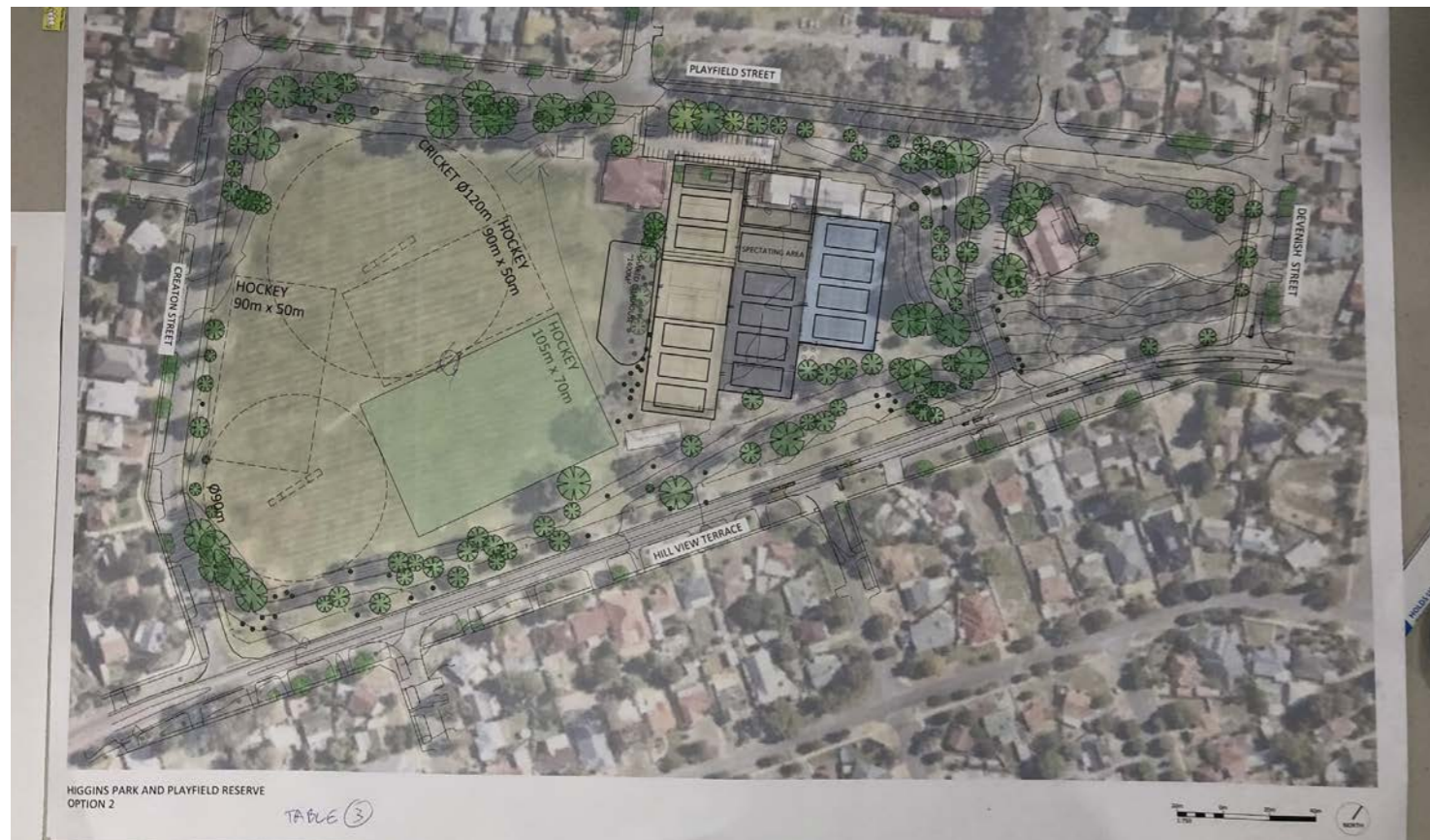
Table 3 - Option 2 *No response entered