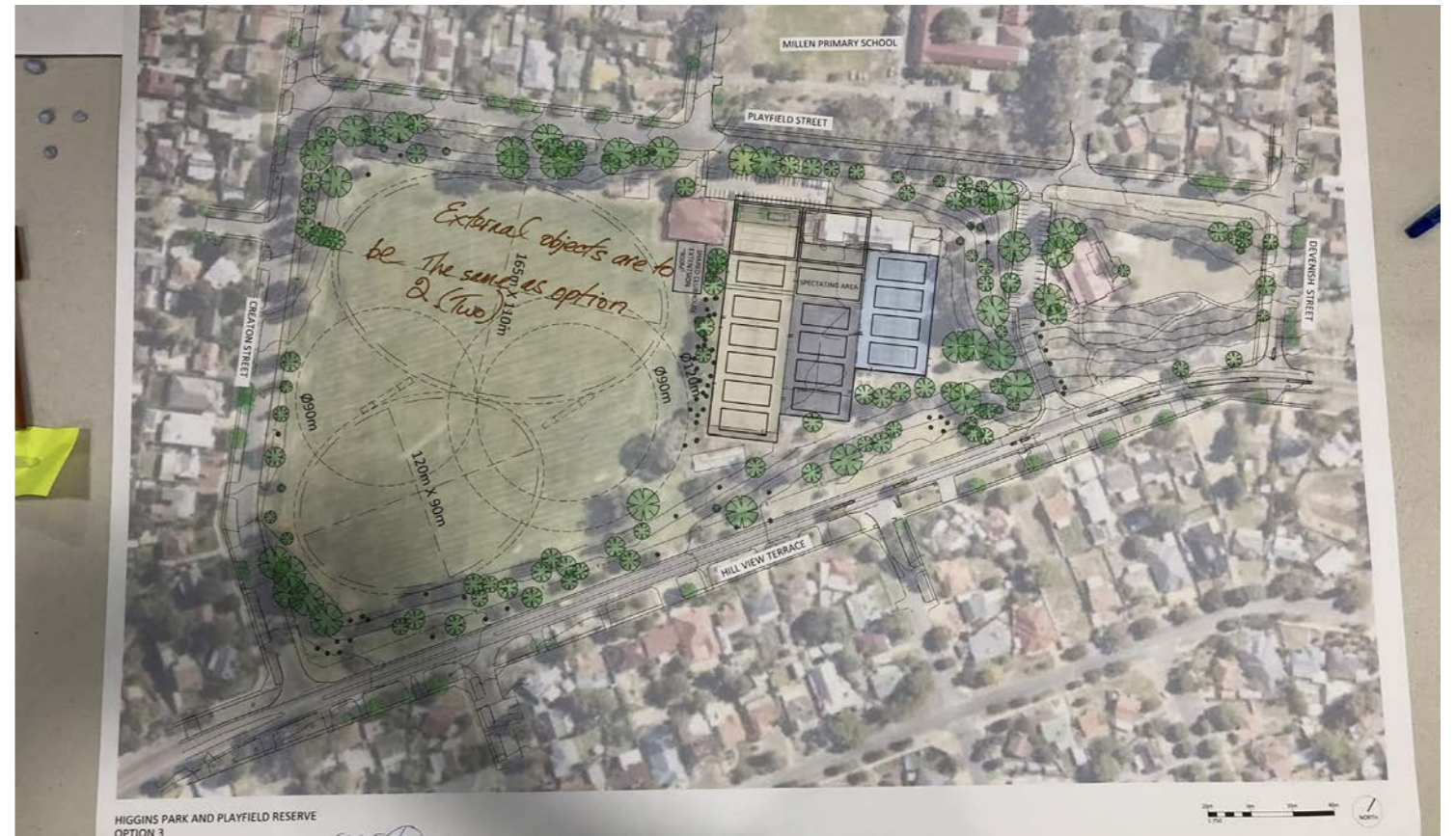
Table 6 - Option 3