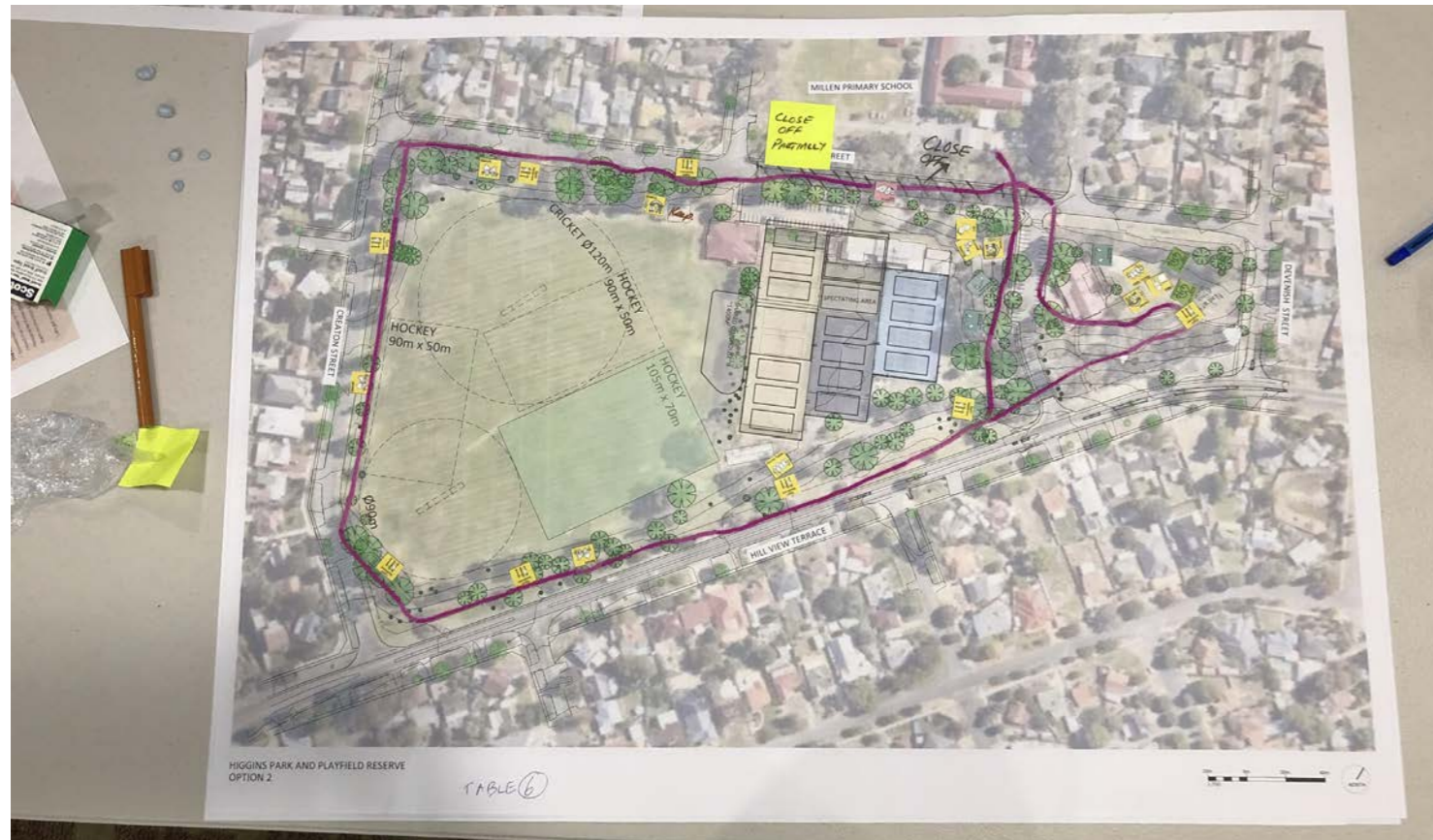
Table 6 - Option 2