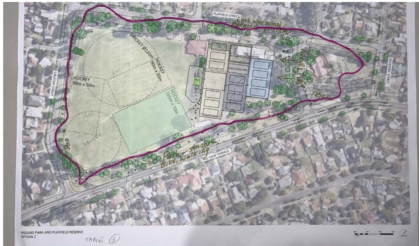
Table 5 -Option 2