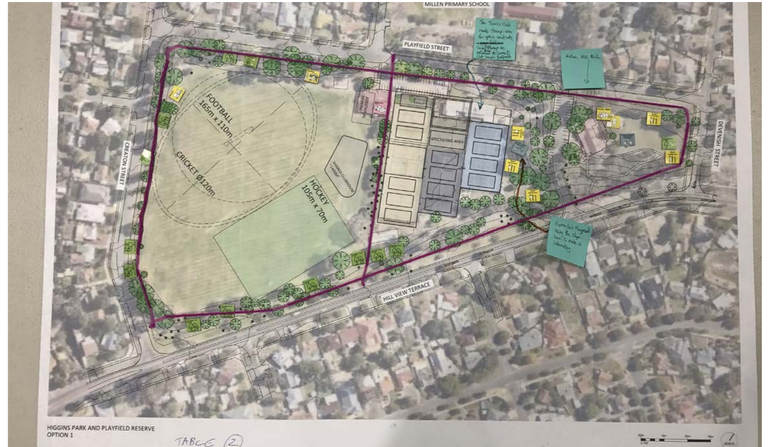
Table 2 - Option 1