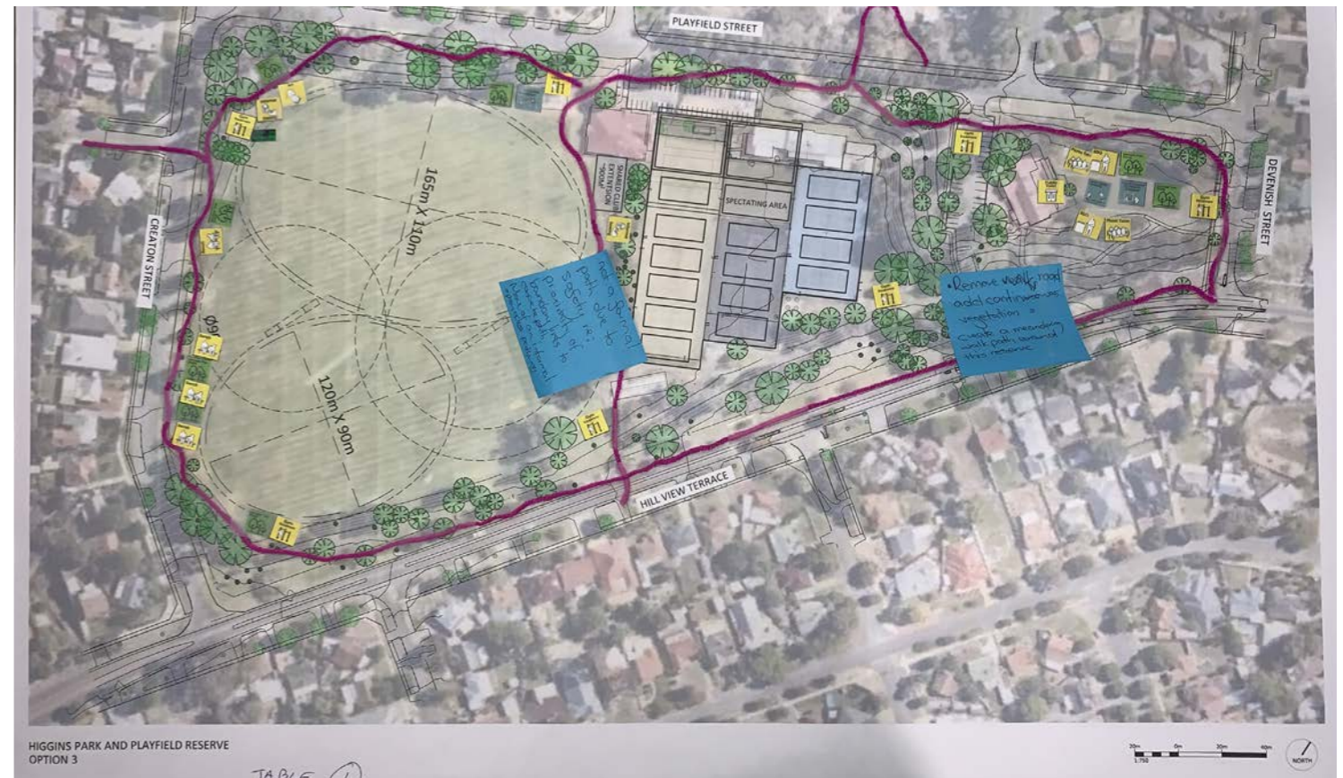
Table 1 - Option 3