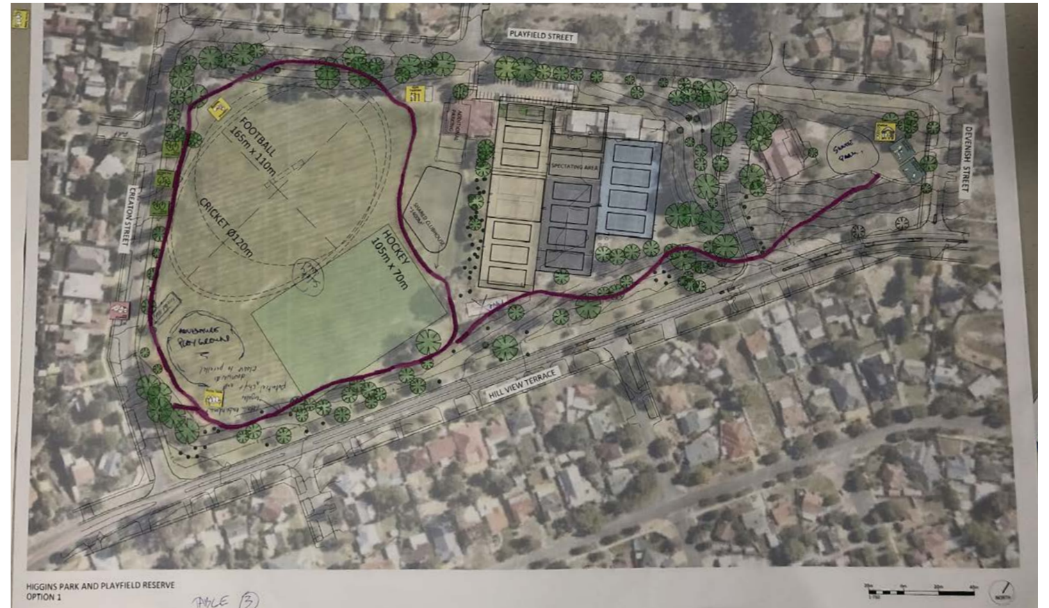
Table 3 - Option 1