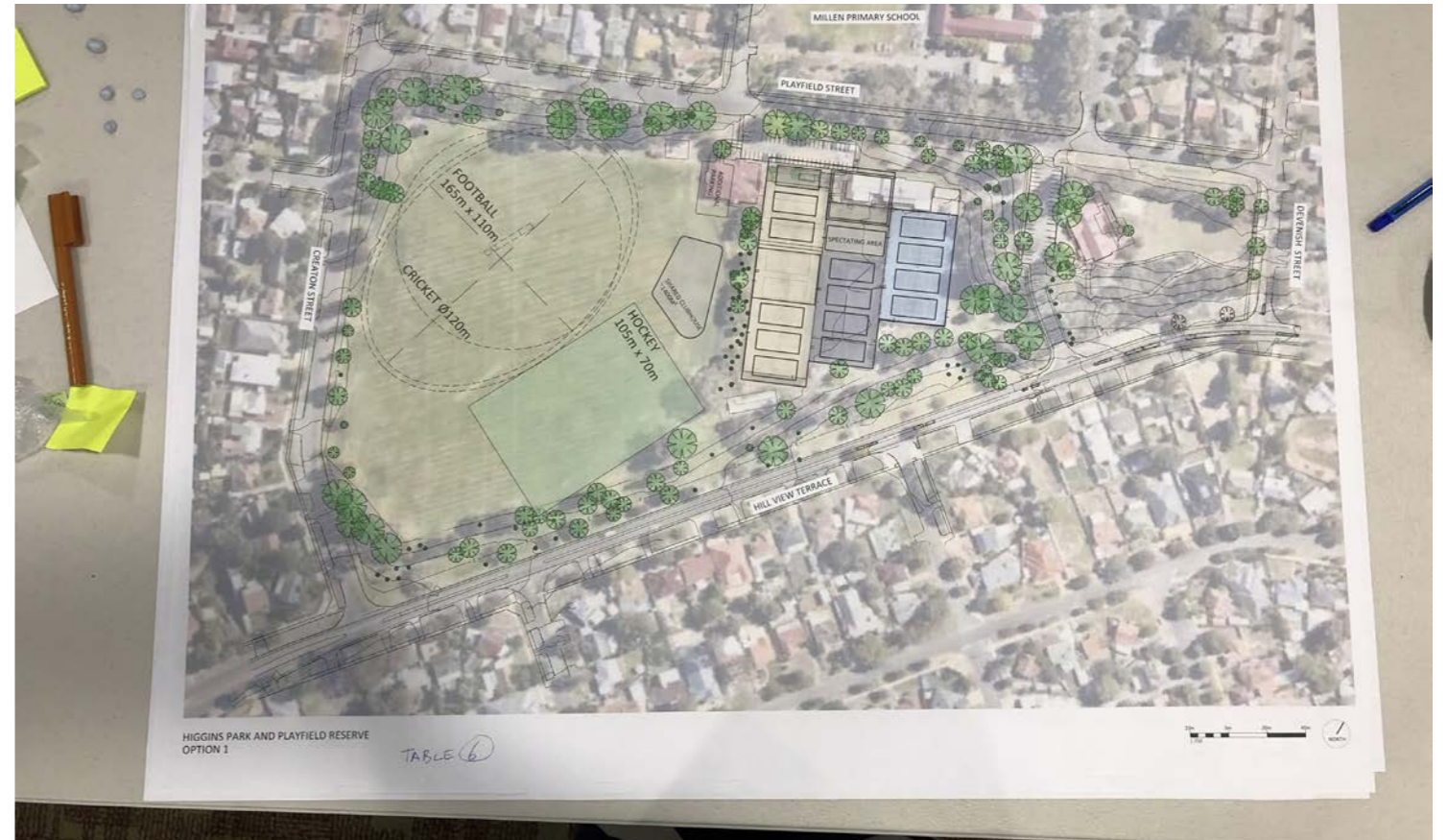
Table 6 - Option 1