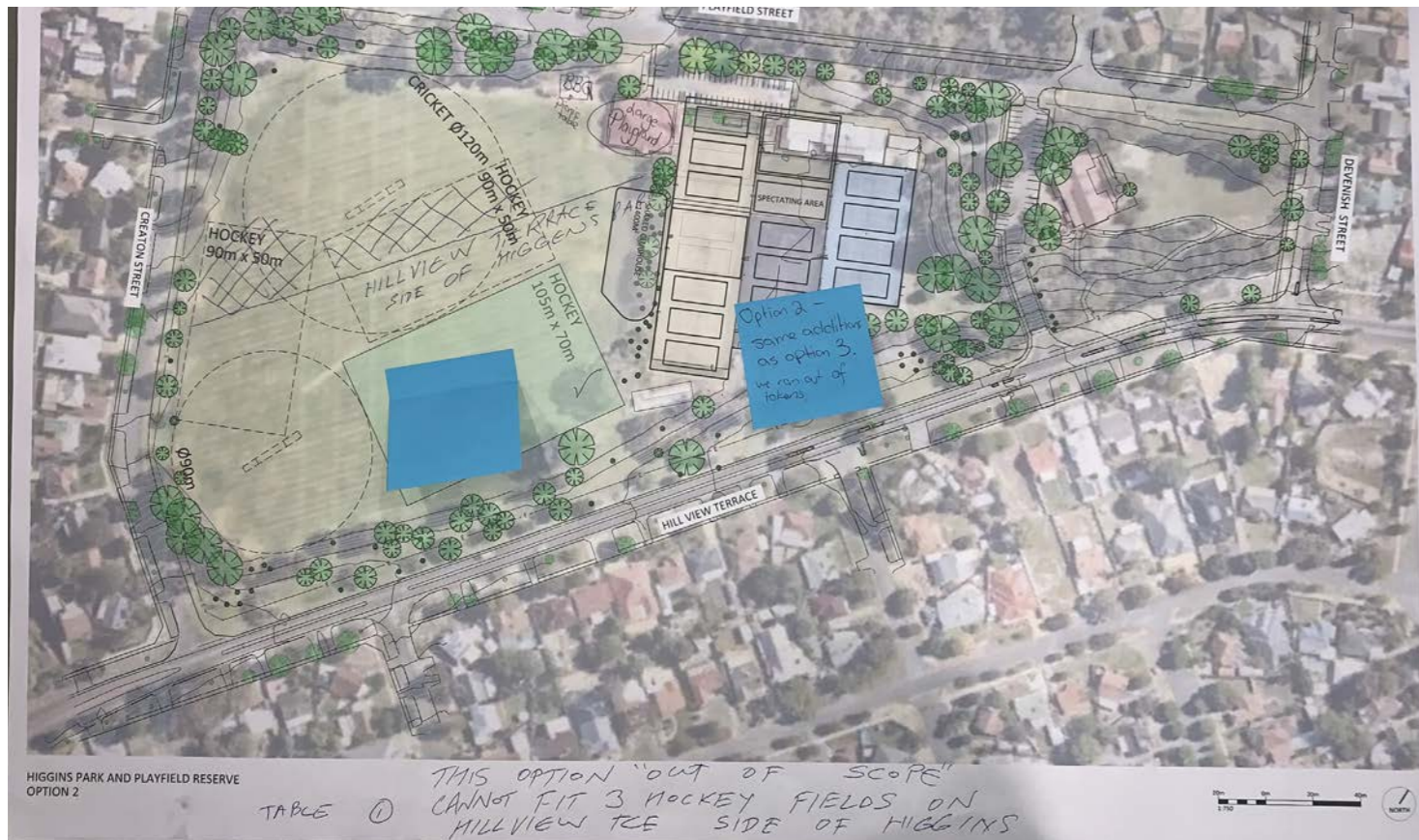
Table 1 - Option 2