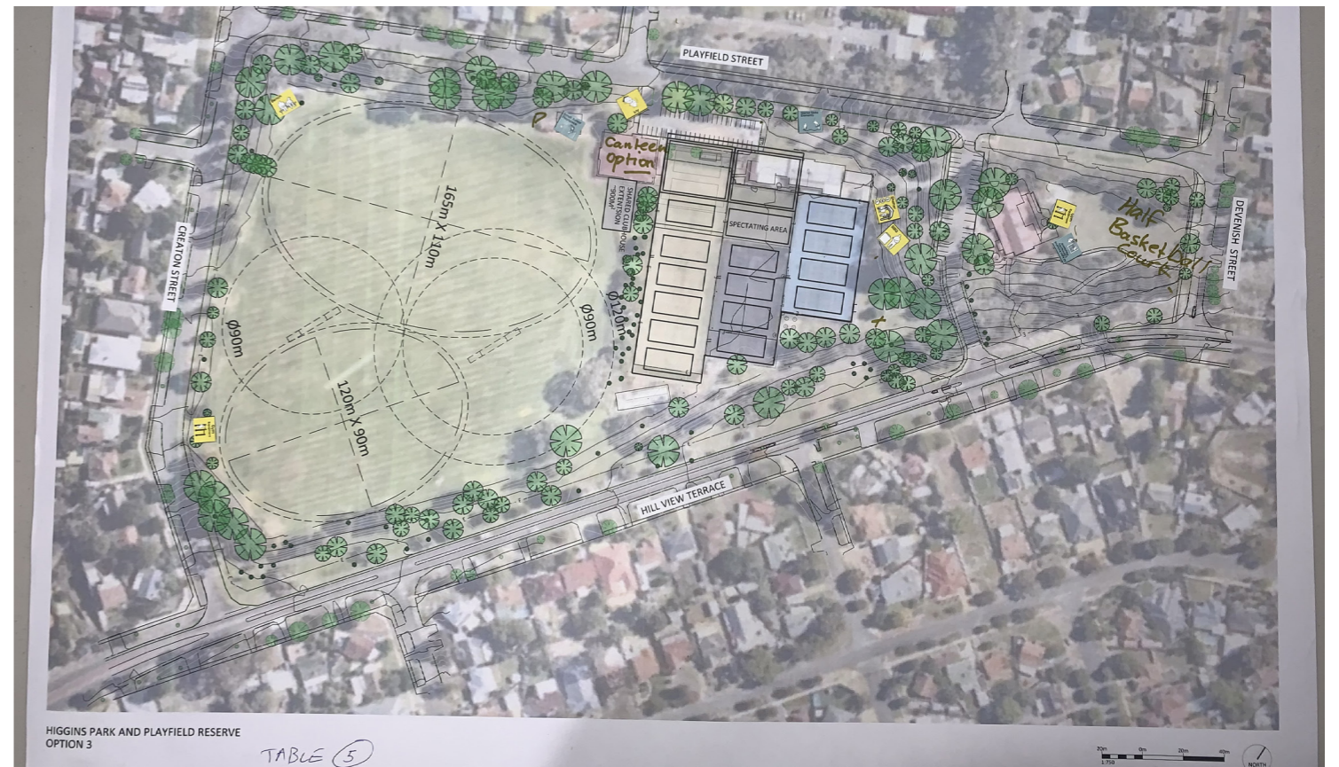
Table 5 -Option 3