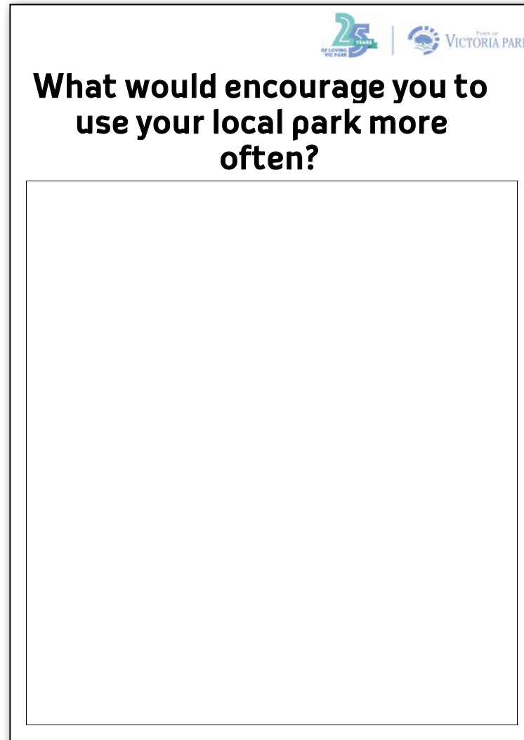
Table 2. Open Ended Question Sheet