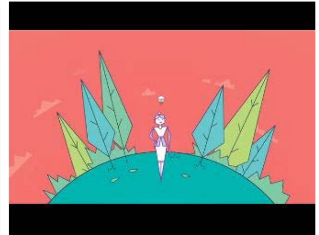
Image 5. Your Thoughts Video Clip, ToVP Website