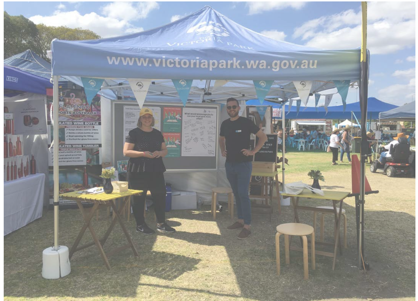
Image 3. Perth Garden Festival 2019

The Town facilitated two surveys with the wider public. The first being a survey at the Perth Garden Festival (PGF) where the Town set up an information booth. The booth at PGF introduced the POS Strategy and gathered qualitative feedback by means of an open ended question and asking participants to rate a number of POS-related statements. The second survey was distributed using the Town's Your Thoughts platform. This provided further opportunity for Town residents and visitors to provide feedback on 27 short questions relating to the Town and what it has to offer. The Your Thoughts survey was supported by a short video.